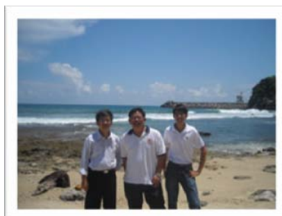
The ocean which was once hit by the Tsunami.