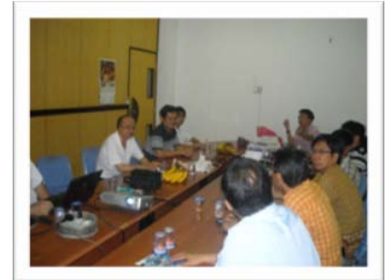
With the School Board

We met with the School Board over dinner. The discussion was very fruitful and overall the response to our presentation was very positive.